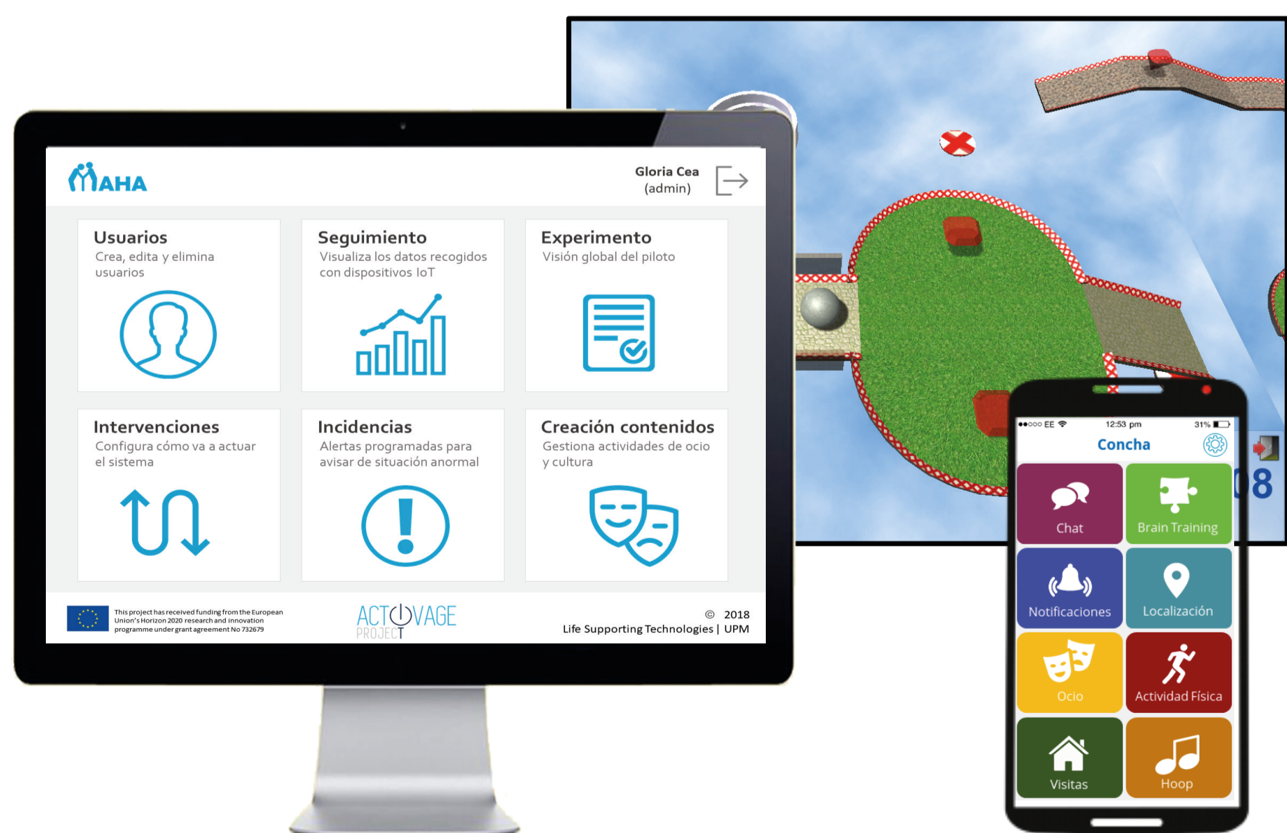
Formal carers dashboard